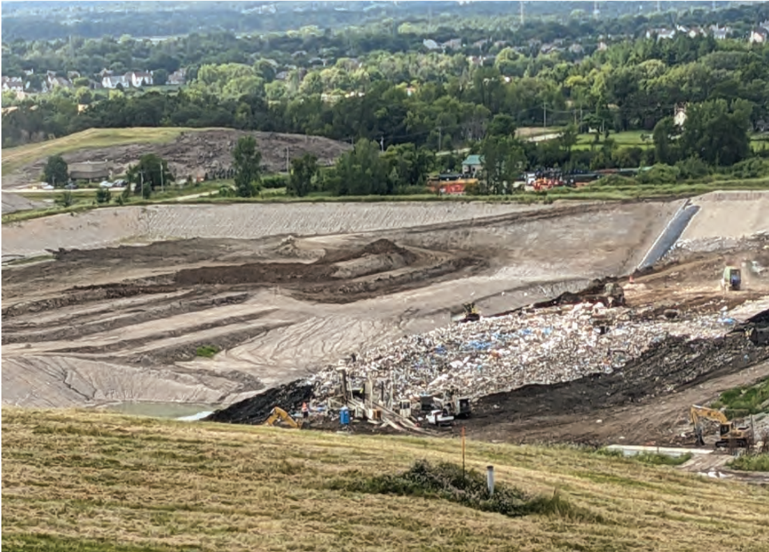
Phase 3, half of phase as working face, cover prepared about waste