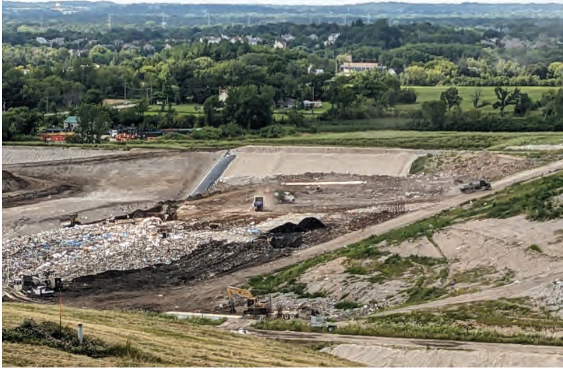
Overview of North Expansion West, Phase 3