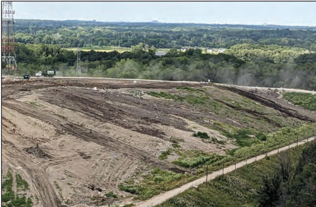
Northeast corner of Phase 1