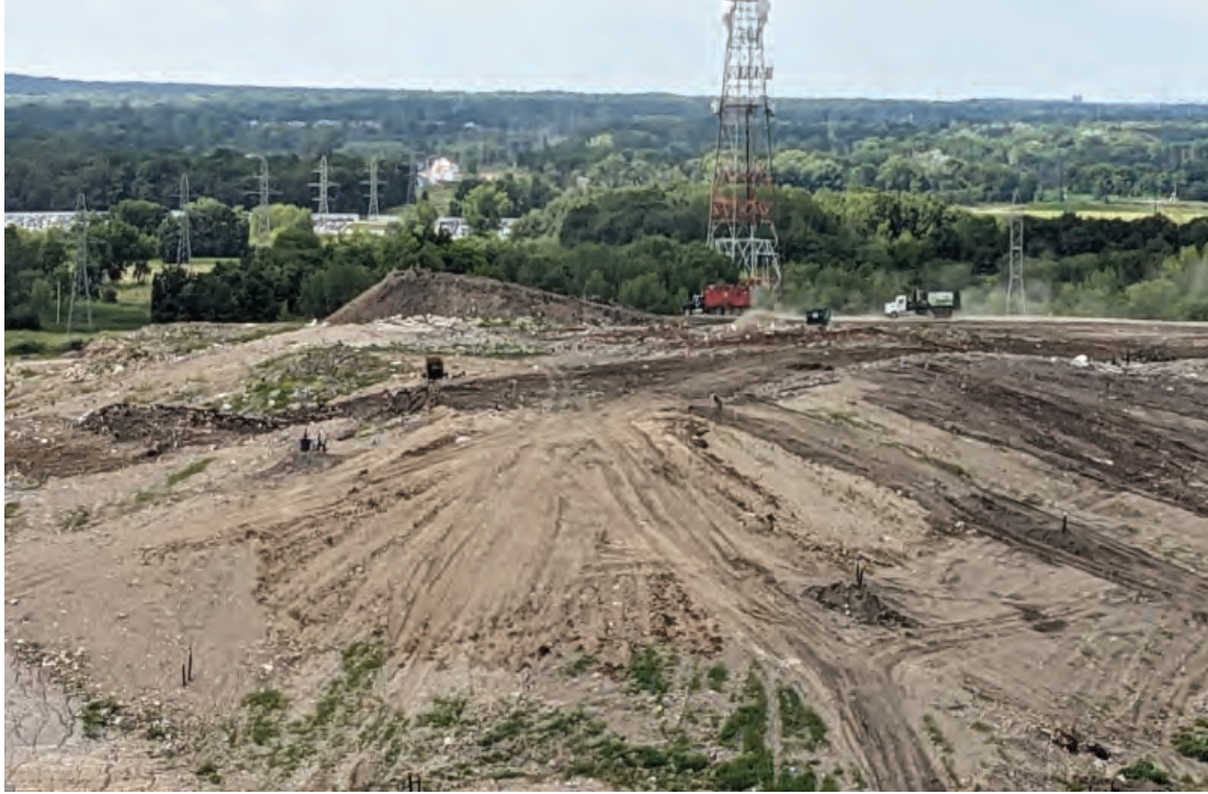
Top of Phase 1 &2