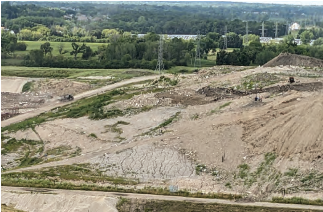
West slope and body of Phase 2